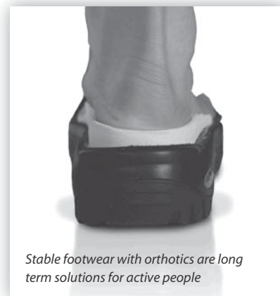
Stable footwear with orthotics are long term solutions for active people

Thin, rigid orthotics are also available and are extremely useful in footwear that has poor support between the heel and ball of the foot. This may include dress shoes, skates, golf shoes and working boots.