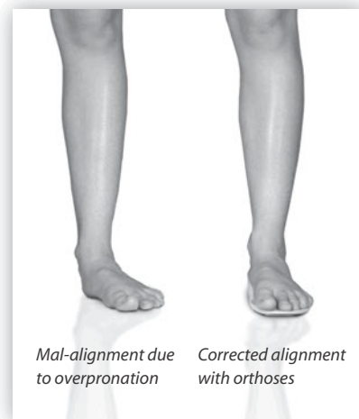
Mal-alignment due to overpronation

The BioPed Pedorthist is specialized in the casting, manufacturing, fitting and modification of many types of custom-made orthotics. Orthotics reflect the patient's condition, lifestyle and footwear requirements. A selection of fashionable footwear that are orthotic friendly, blended with on-site labs that can mould and shape footwear to fit, offers the patient relief from foot problems.